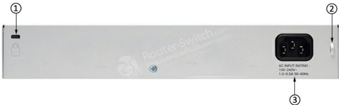
Figure 3 shows the back panel of WS-C2960L-8TS-LL.